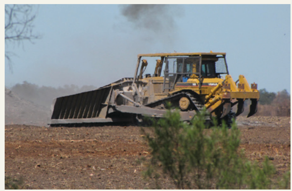
LAND CLEARING IN NORTHWEST NEW SOUTH WALES, OCTOBER 2012