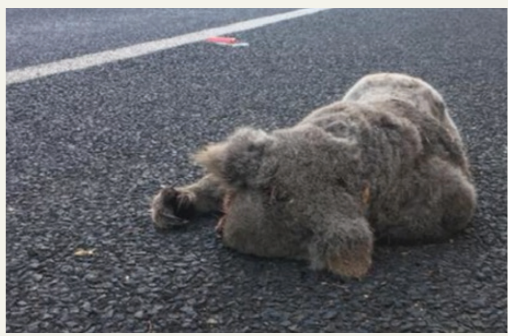
KOALA KILLED IN CAMPBELLTOWN, NSW 'HELP SAVE THE WILDLIFE AND BUSHLANDS IN CAMPBELLTOWN'