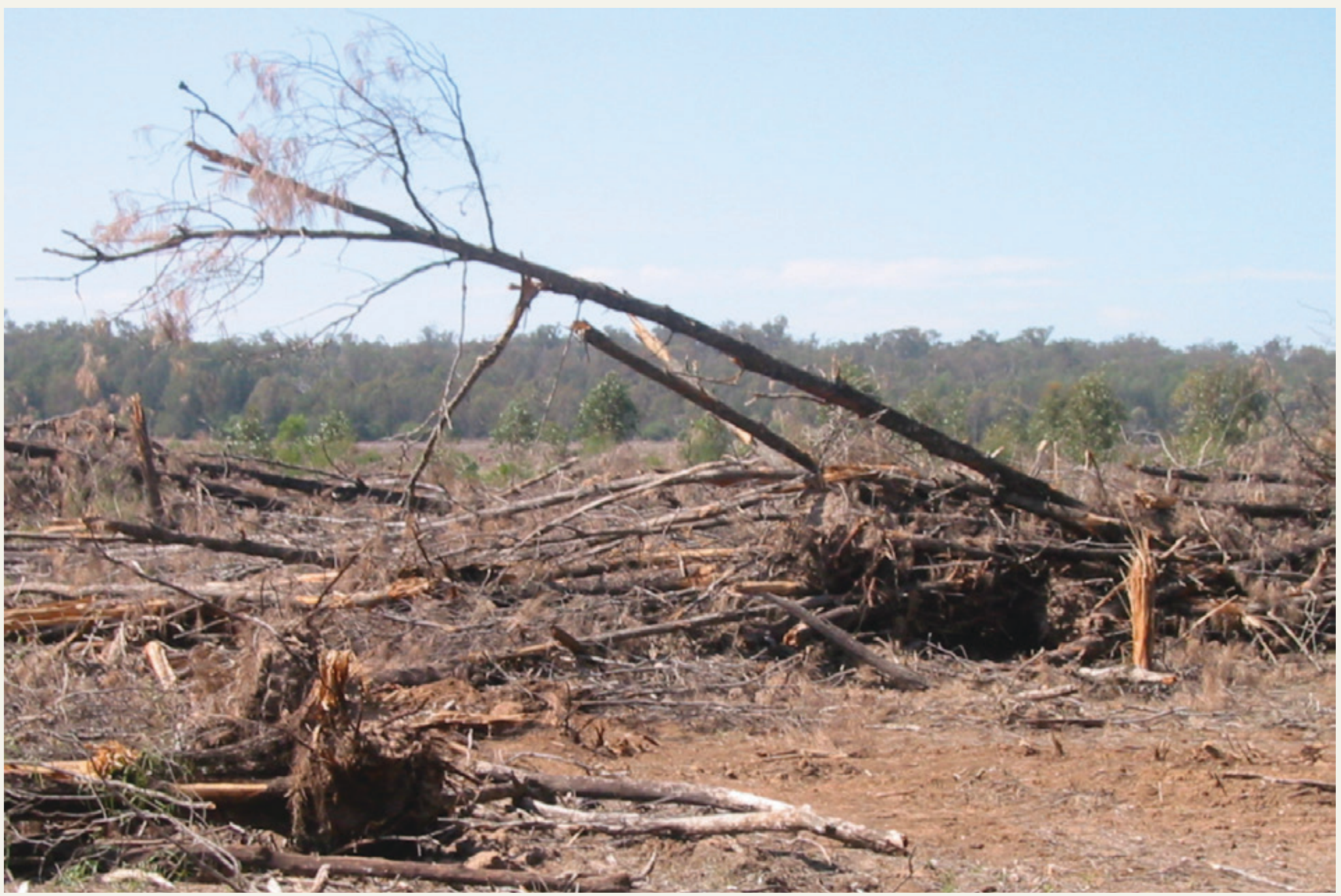
ANDCLEARING IN NORTHWEST NEW SOUTH WALES