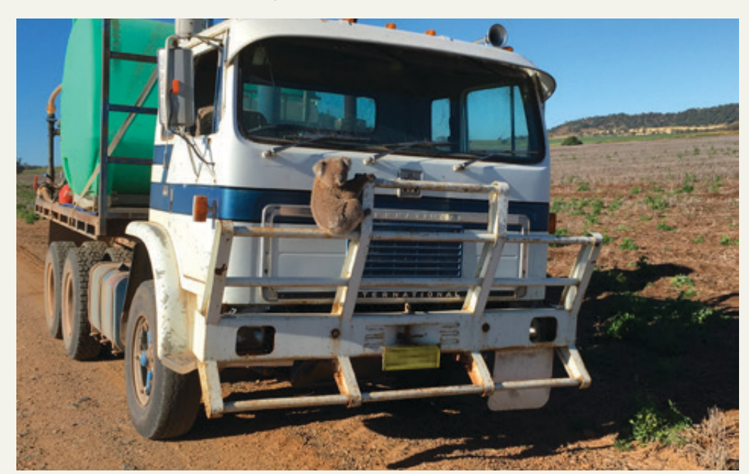
KOALA DISCOVERED CLINGING TO A TRUCK ON A FARM IN GUNNEDAH, NSW IN NOVEMBER 2016