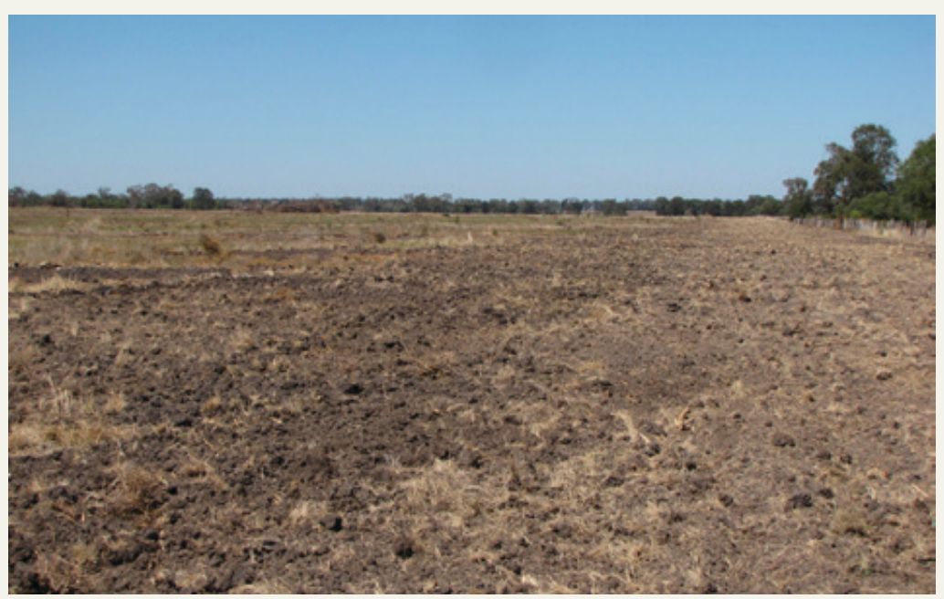
LANDCLEARING IN NORTHWEST NEW SOUTH WALES, OCTOBER 2012