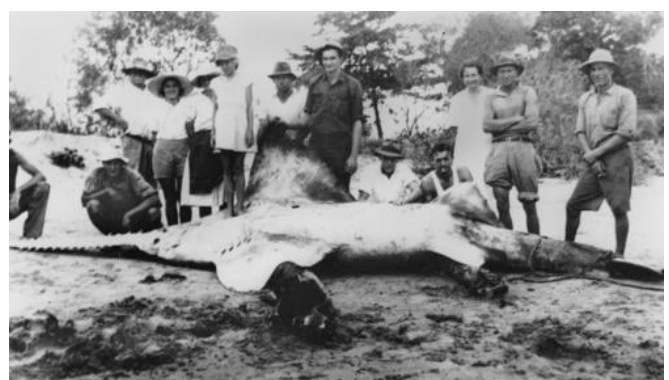
Freshwater sawfish ( Pristis pristis ) caught at the mouth of the Mulgrave River 1938, now largely restricted on the east coast to the waterways draining into Princess Charlotte Bay.