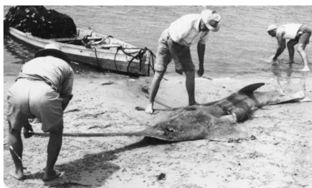
Green sawfish ( Pristis zijsron ) captured off Maroochydore in 1940. This species once occurred from NSW northwards but is now thought to be extinct from Cairns south.