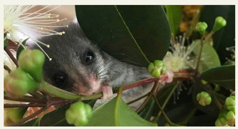
Image: Eastern Pygmy-possum joey rescued by WIRES late last year near the edge of a road on the Mid South Coast weighing just 6 grams. She was in care until she was 16 grams and then released successfully back to the wild.

DEPRIVATION AND EXPOSURE: Deprivation suffered by animals due to clearing includes suffocation, starvation, dehydration, heat exposure and heat stroke. Burrowing or small animals, or those lying stunned or injured on the ground during clearing, may be buried alive and suffocated or trapped under timber or earth as it is moved around by machinery. Small animals suddenly left in a treeless environment may be unable to reach other habitat in time to avoid predation, starvation, dehydration or heat stroke. This is a high risk for young and orphaned animals, including pouch marsupials and nestlings. Starvation or exposure also occurs when animals flee to other habitats, where they would often face overcrowding, conflict and exclusion or expulsion.