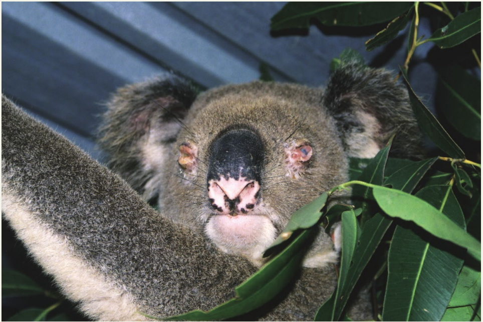
KOALA EYE INFECTION

The vertebrate stress response becomes debilitating if it reaches overload. At that point, immunity may be compromised, resulting in infection and illness. Traumatic injuries, especially lacerations, greatly increase the risk of infection. Animals that survive their injuries are likely to suffer secondary infections. Food shortages, exposure and stress also lead to increased disease risk.