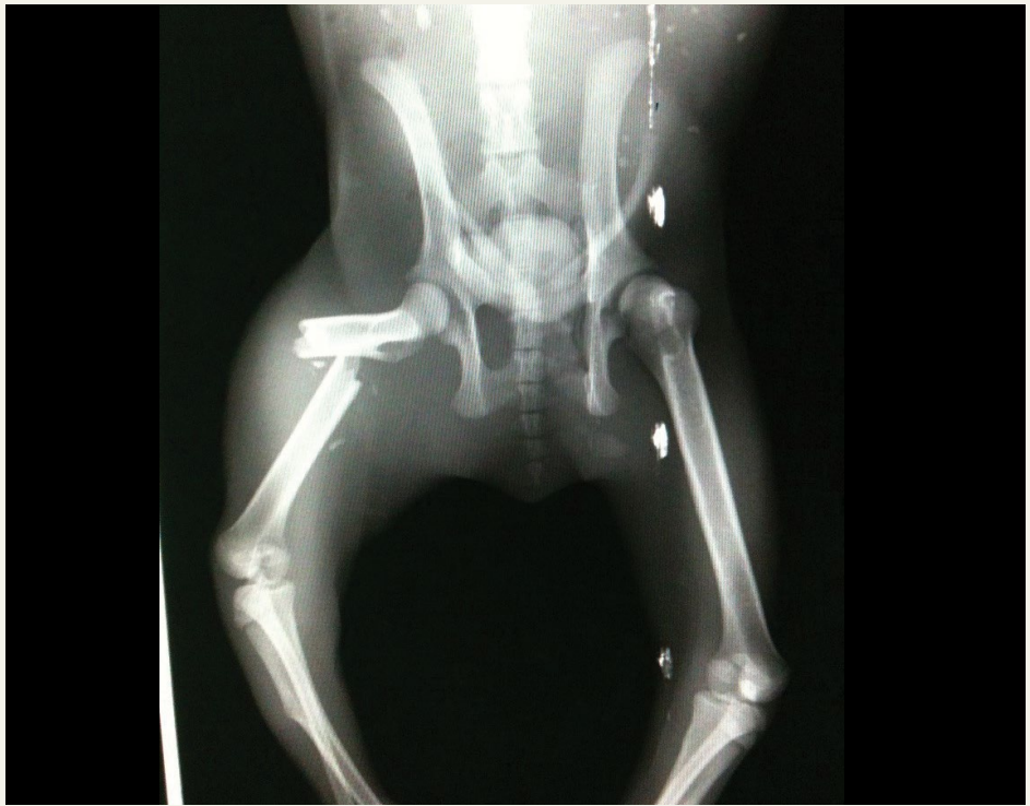
X-RAY OF KOALA WITH LEG FRACTURE FROM VEHICLE STRIKE, APRIL 2017

BURNS : In rural areas, log piles may be burnt after clearing. Any animals sheltering in those logs are likely to be burnt to death or suffer burns as they escape the fire.