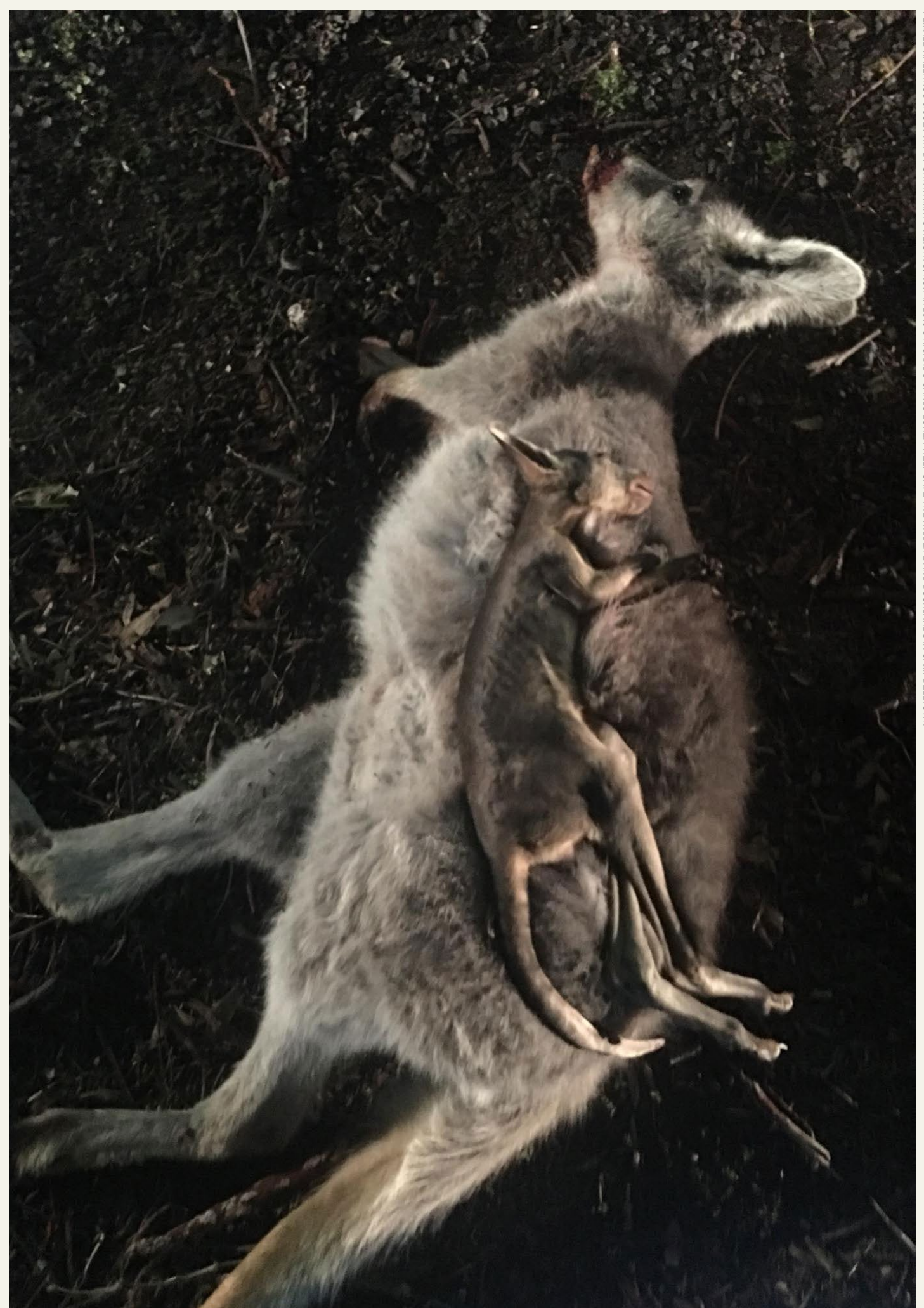
FEMALE WALLAROO & JOEY HIT BY CAR IN MINTO HEIGHTS, NSW IN 2018 'HELP SAVE THE WILDLIFE AND BUSHLANDS IN CAMPBELLTOWN'