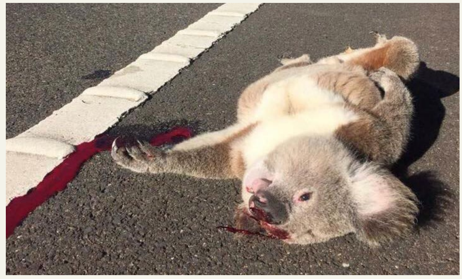
KOALA KILLED ON THE ROADSIDE IN CAMPBELLTOWN, NSW IN 2018 © RICARDO CARLO LONZA 'HELP SAVE THE WILDLIFE AND BUSHLANDS IN CAMPBELLTOWN'

However, because it is largely invisible and occurs far from the public gaze, public recognition of the wild animal welfare crisis is low, compared with relatively high public awareness of the welfare issues for pets and livestock (Box 1).