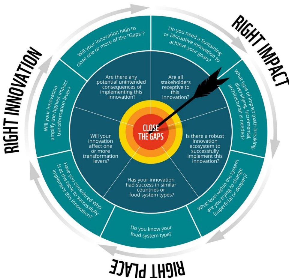
Figure 2: There is not a "Right" place to begin when taking a strategic and structured approach for choosing the right innovation, with the right level of impact, for the right place. Instead, any stakeholder working on innovation should start at a place that makes most sense for them and then ask strategic questions to ensure the innovation being considered will help to close the gaps.

To facilitate this, WWF has developed the Right Innovation, Right Impact, Right Place framework (Figure 2) to help anyone designing or supporting innovations in food systems build a toolkit to maximize impact and achieve national-level health and environmental goals. The framework helps in choosing innovations that will best amplify high-impact actions; anticipate the kind of change and impact any proposed innovation might have and use systems thinking to identify and treat root causes of the problems we want to reverse; and understand the social and ecological context in which the innovation is to be implemented. This helps anticipate unintended consequences that can arise when innovations are not critically reviewed.