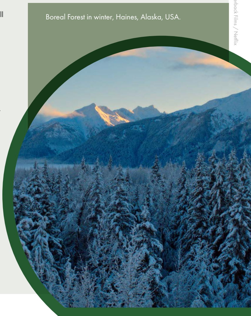
Boreal Forest in winter, Haines, Alaska, USA.

Plantation forests (areas of land planted with trees specifically to provide timber) can be carefully managed so that less pressure is put on natural forests. Well managed plantations close to natural forest can protect and expand the habitat for wildlife, and brings many of the same benefits to the environment that natural forests do.