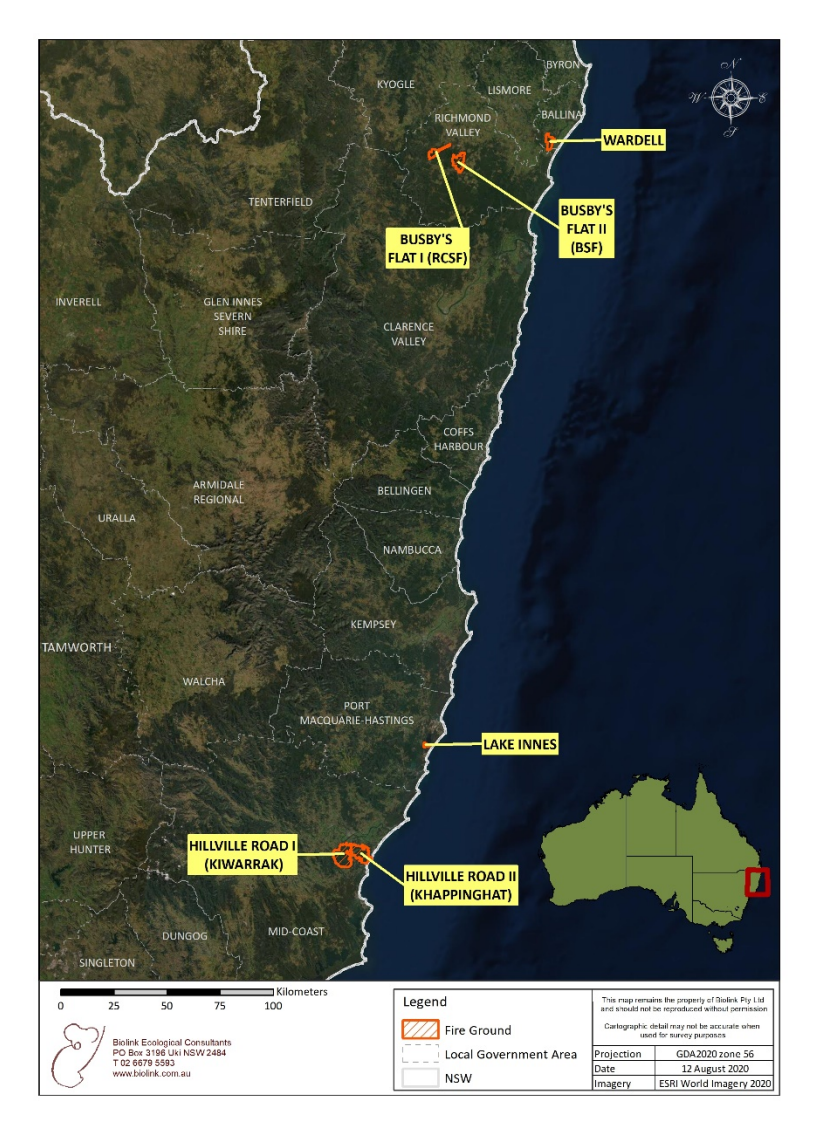
Figure 1 . Locations of the six fire-grounds resurveyed on the NSW north coast between Foster and Wardell in terms of NSW Local Government Area boundaries.

Survey work was completed over three-month period (Mar – May 2020). Two hundred and twenty-seven (227) field sites distributed across six fire grounds were potentially available for re-assessment, 123 of which were able to be re-surveyed. Not all areas within individual fire grounds were able to be accessed because of safety concerns and/or logistical issues such as fallen trees across tracks. Figure 1 illustrates the locations of each of the six fire grounds that were sampled.