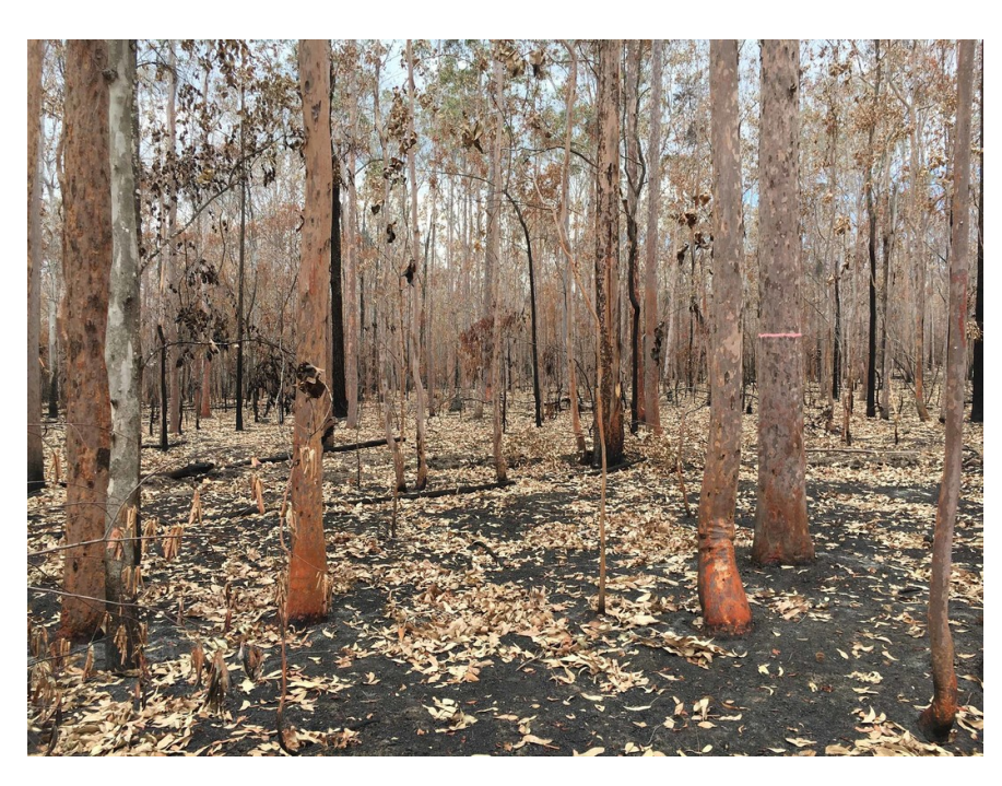
Bushfire ravaged Busby's Flat, NSW.

Twenty-two (22) sites were able to be resurveyed in the RCSF, 11 of which were known to have pre -fire evidence of habitat use by koalas. Post -fire, three of the 22 field sites returned evidence of habitat utilisation by koalas. Twenty-one (21) field sites were resurveyed in BSF, of which four were known to have pre -fire evidence of habitat use by koalas. Post -fire, two of the 21 field sites returned evidence of post -fire utilisation by koalas, both of which did not have scats recorded previously.